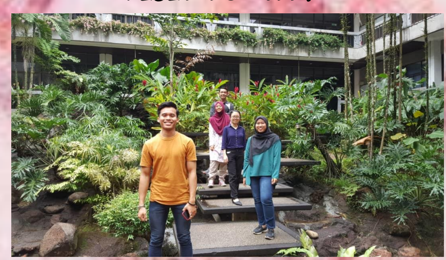
VISIT TO UTM