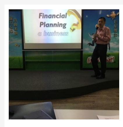
Financial Planning Course

Equip myself with knowledge of financial planning throughout the whole programme.