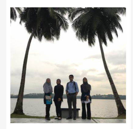
Pass the exam!