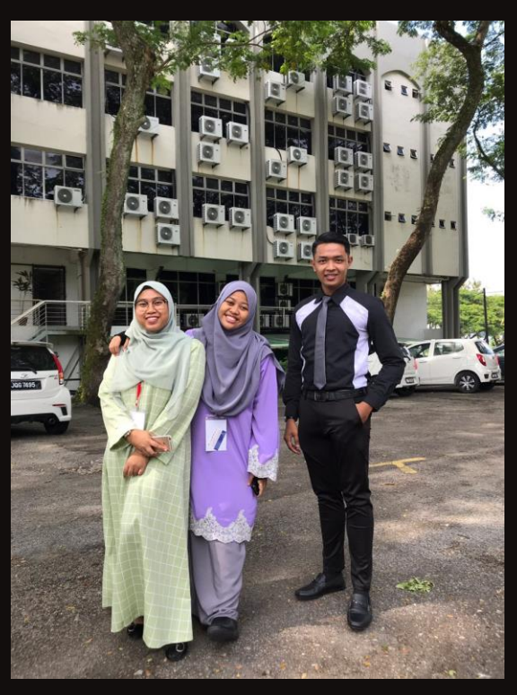
ALHAMDUILILLAH ALL PASSED