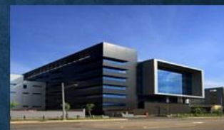
OWN A COMPANY 2030 | AGE : 35