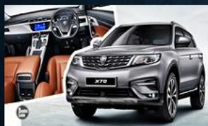
PROTON X70 2022 | AGE : 27 | RM90K