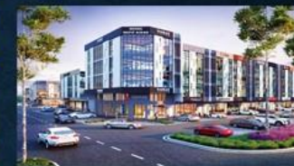
PROPERTY INVESTMENT START 2025 | AGE : 30