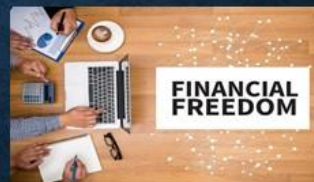
PASSIVE INCOME > EXPENSES 2035 | AGE : 40