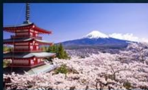
DREAM VACATION (JAPAN) 2022 | AGE : 27