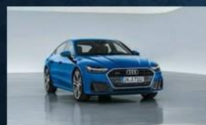
AUDI RS7 2030 | AGE : 35 | RM600K