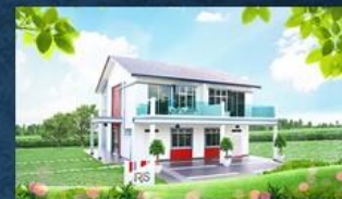
MY FIRST HOUSE 2020 | AGE : 25 | RM350K