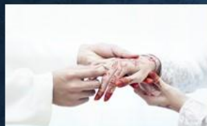
GET MARRIED 2022 | AGE : 27 | RM30K