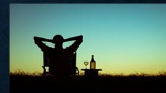
RETIREMENT PHASE 2050 | AGE : 55