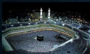
PERFORMING HAJJ 2025 | AGE : 30 | RM50K