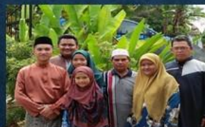
MY BIGGEST WHY! To make my family happily