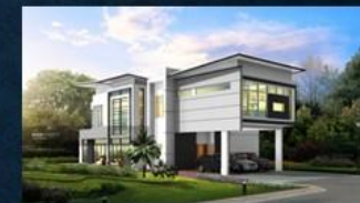
MY DREAM HOUSE 2030 | AGE : 35 | RM 2 MILLION