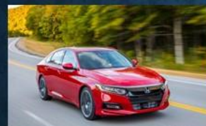
HONDA ACCORD 2.4L 2025 | AGE : 30 | RM150K