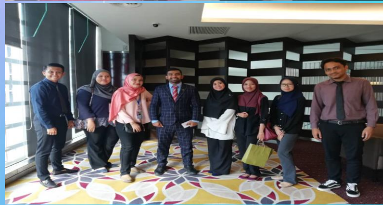
MEET SENIORS IN SUPER GROUP FROM NOTHERN, SOUTHERN & CENTRAL REGION