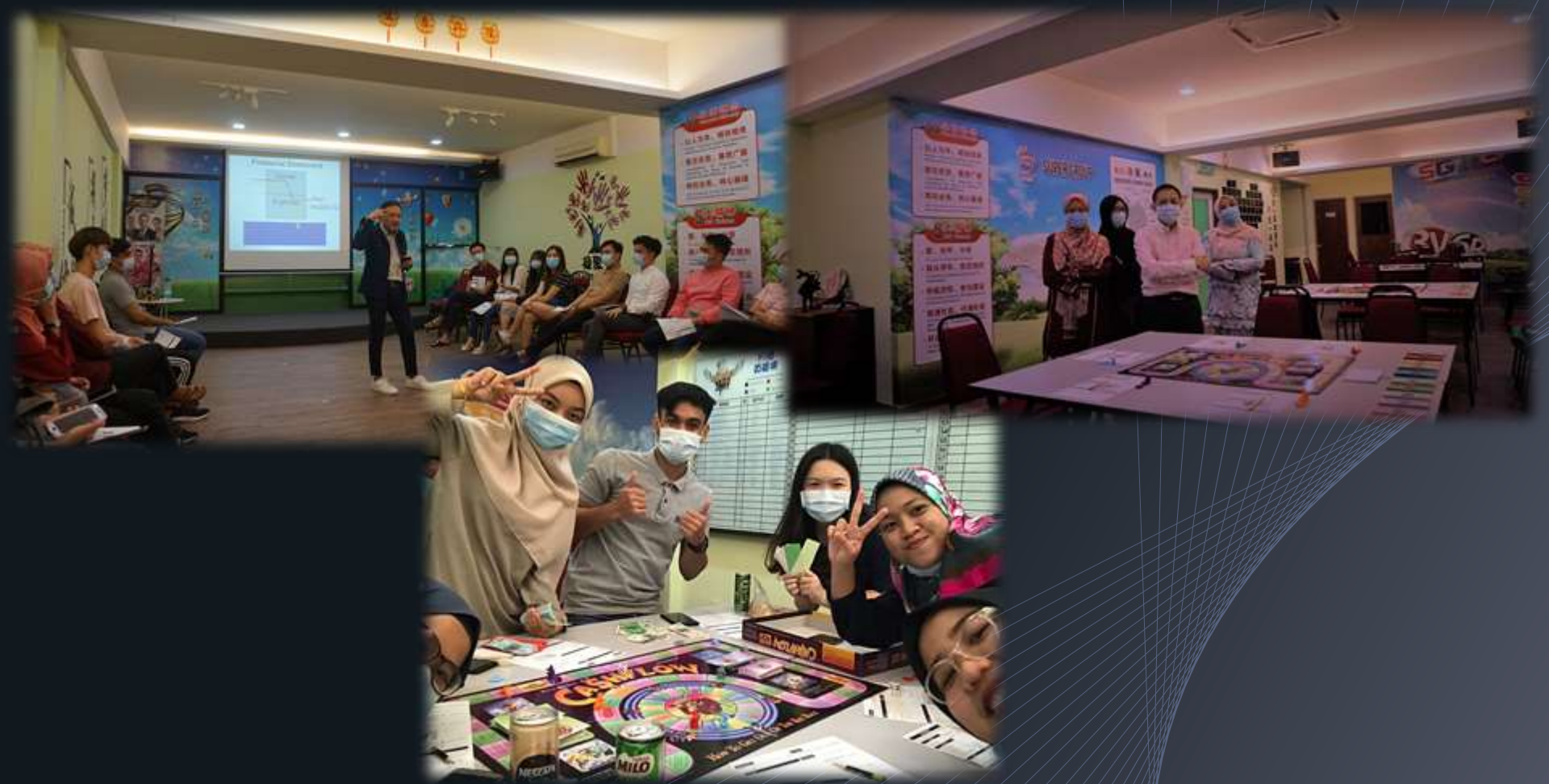
Participated in Cashflow Game