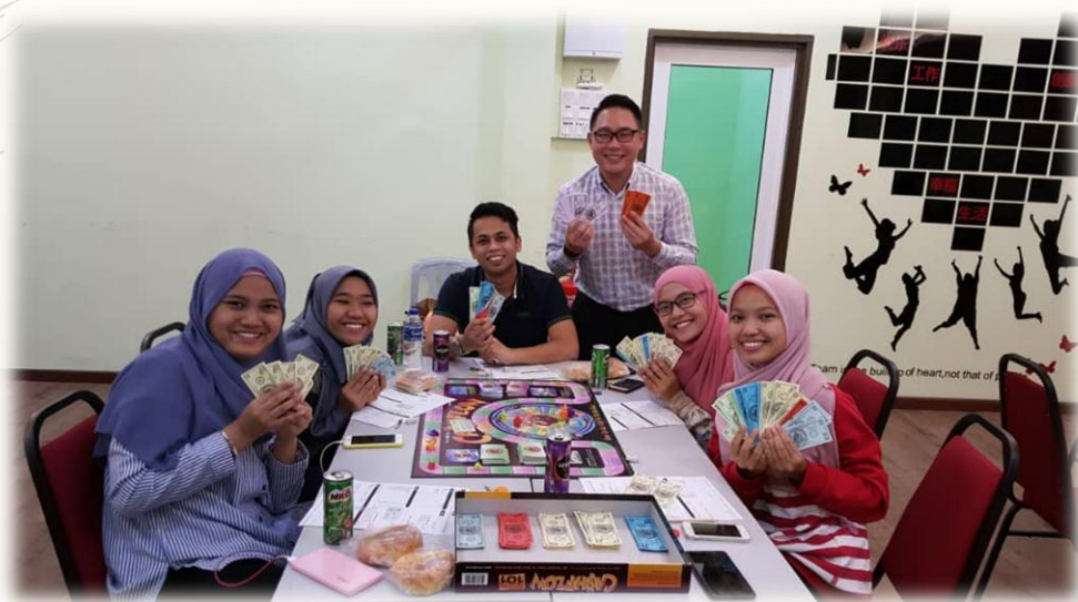
Cashflow game session