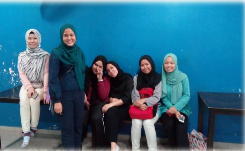
Out for doobby