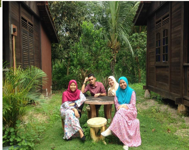
Recreational Camp site UTM