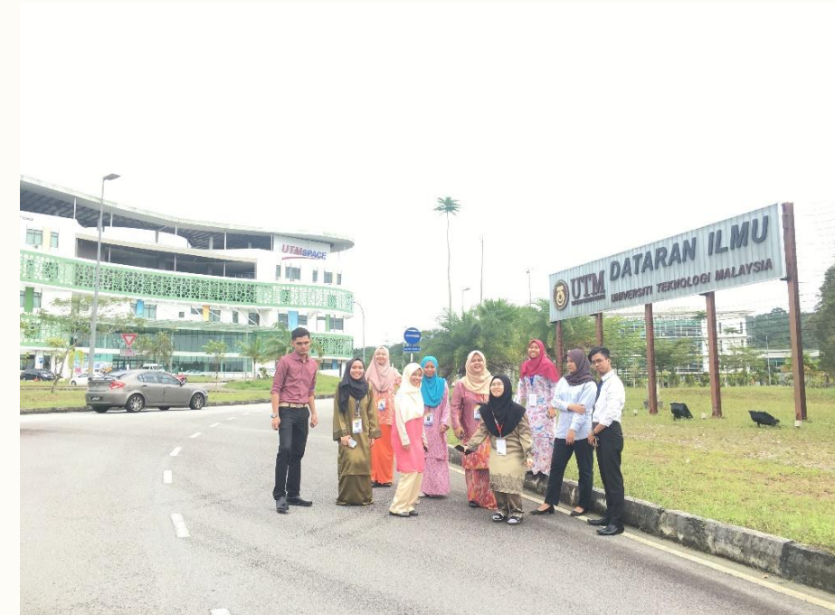
In front of Raja Zarith Sofea Library