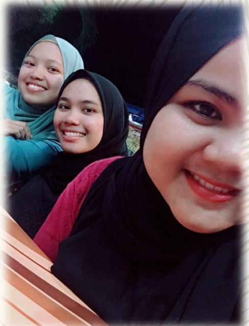
While waiting dinner to be served....