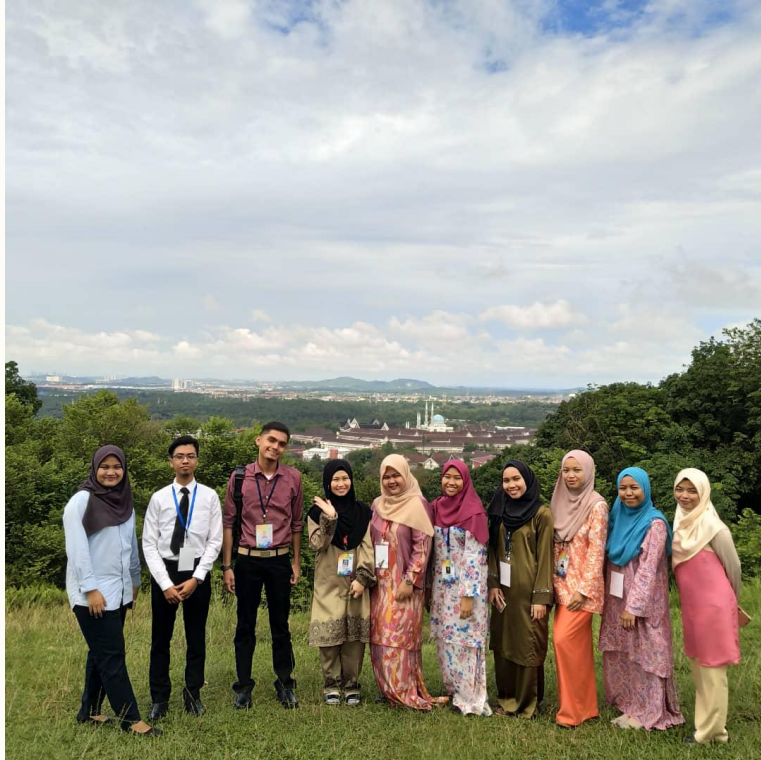
Balai Cerap UTM