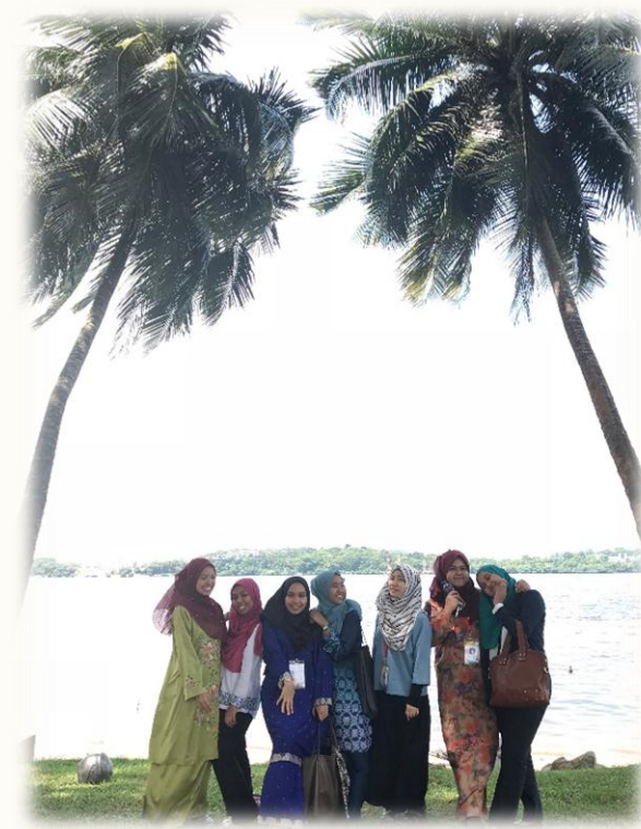
Yeay we passed the test!-Open University JB